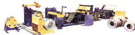
Cut-to-length & Slitting Lines