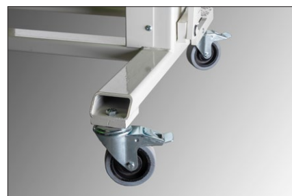
Wheels as standard, lets you move your folder with ease.