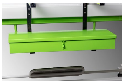
A smart storage box for tools and divided box tooling is standard.